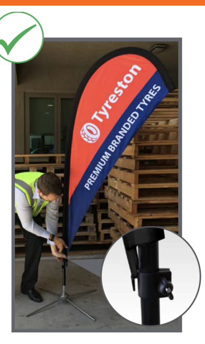
Just Right: Your flag should sit flat with minimal ripples as shown. Hook the fabric loop to the locking mechanism and adjust it by twisting the nozzle to tighten.