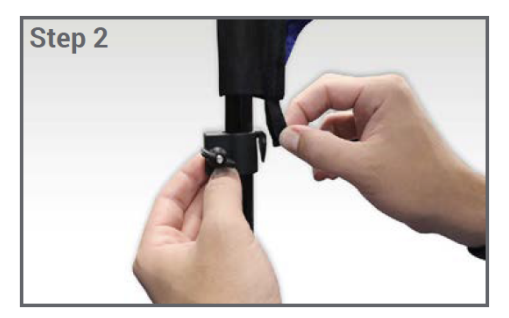
Pull the flag all the way down and attach the fabric loop to the lock hook at the end of the pole.